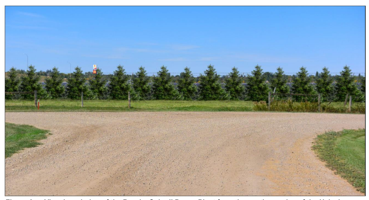
Figure 3: Visual rendering of the Brooks Solar II Power Plant from the southern edge of the Hajash Subdivision looking west<sup>24</sup>

35. Elemental filed a visual rendering of the project's proposed tree buffer, viewed from the southern edge of the Hajash Subdivision looking west, as seen below.